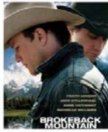
The Autry National Center, in association with Focus Features, presents BEYOND BROKEBACK Part of the OUT WEST at the Autry series