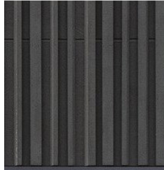
Siding Option 02 Fiber Cement Panel + Wood Battens Hardie® Panel with Wood Nailers, Painted to match Panel