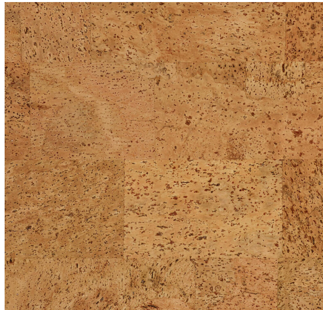
Wood Cork Flooring Throughout