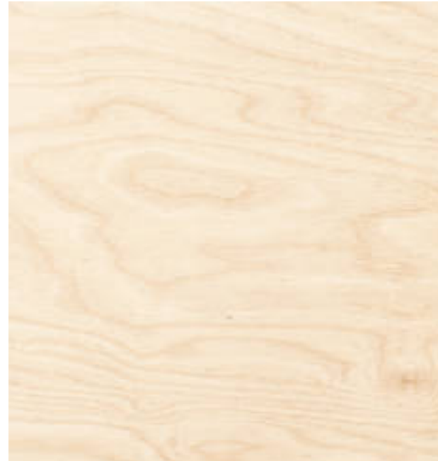
Plywood Feature Ceiling