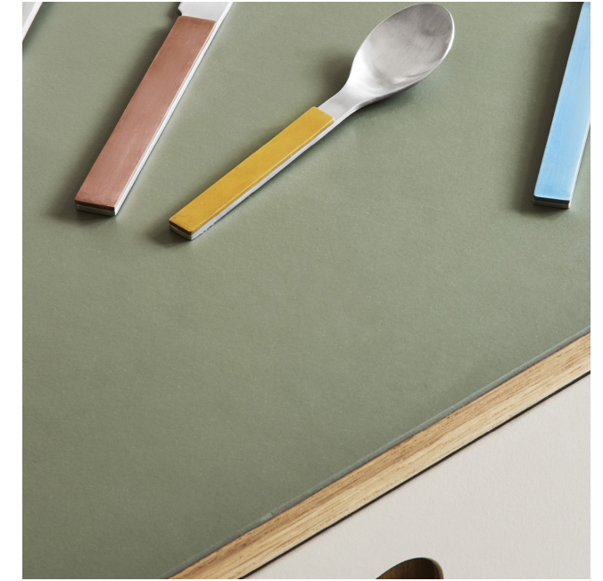
Linoleum Countertops @ Kitchen