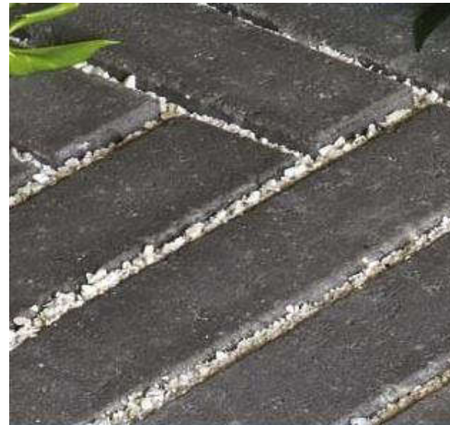
Permeable Pavers Natural Stone