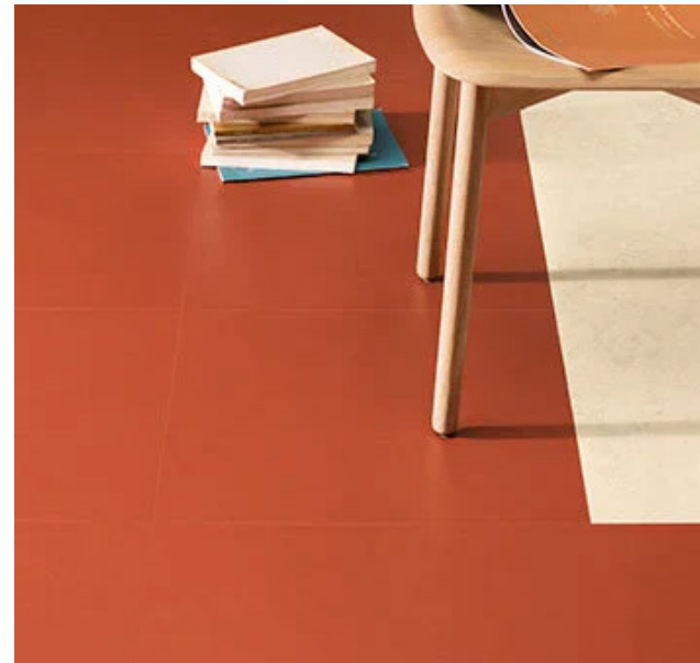
Marmoleum Flooring @ Bathroom