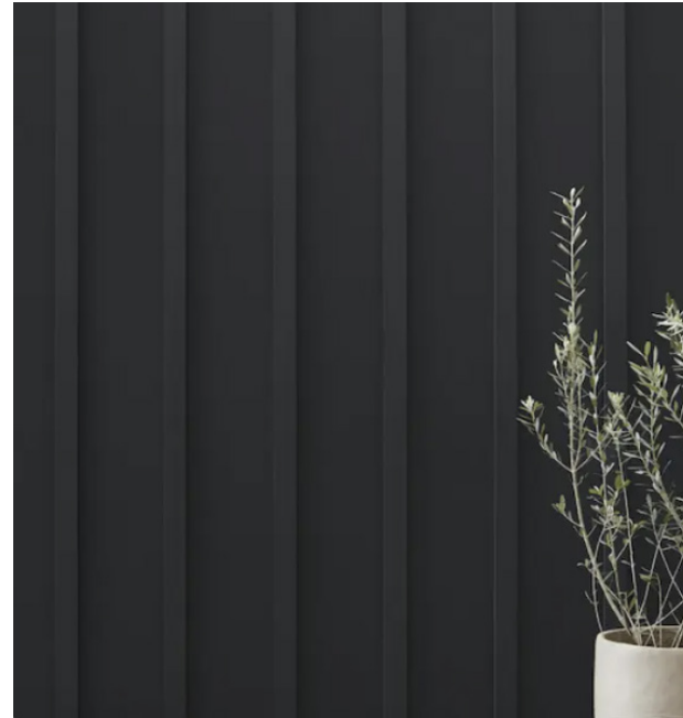
Siding Option 01 Fiber Cement Panel + Battens Hardie® Panel Vertical Siding with Hardie® Trim Boards Batten Strips