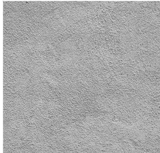
Siding Base Stucco