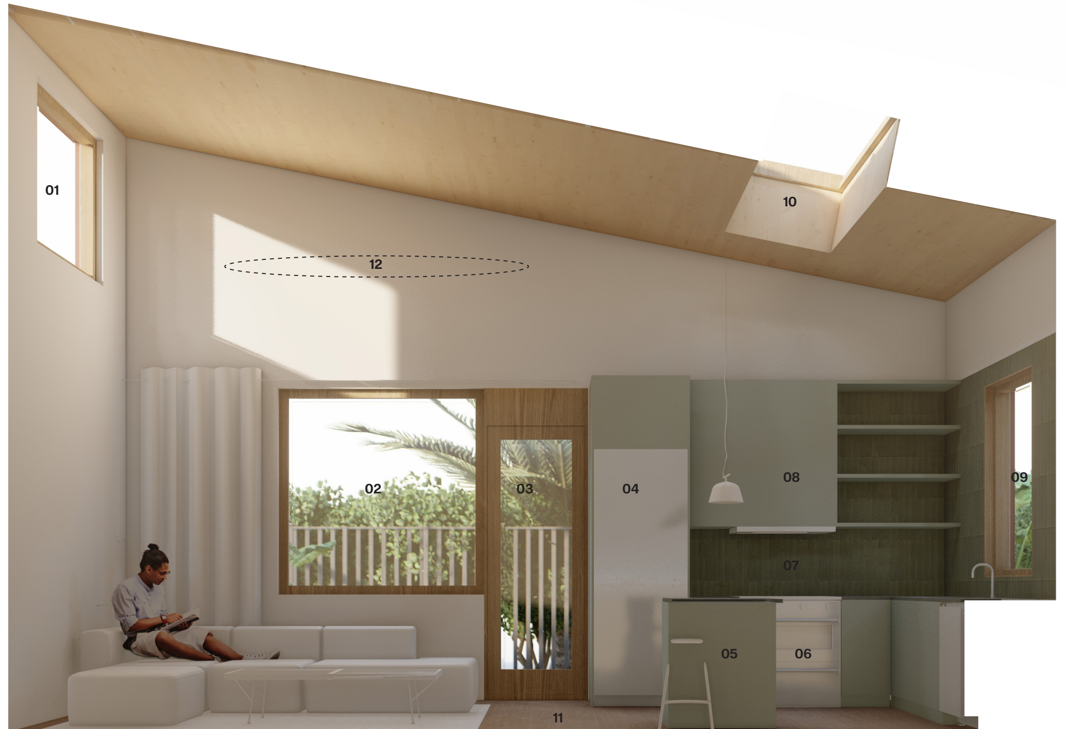
Living + Dining Space Interior Development