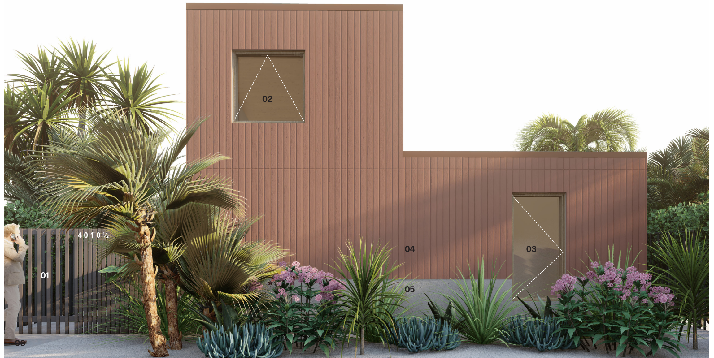
Front Elevation (South) Exterior Development