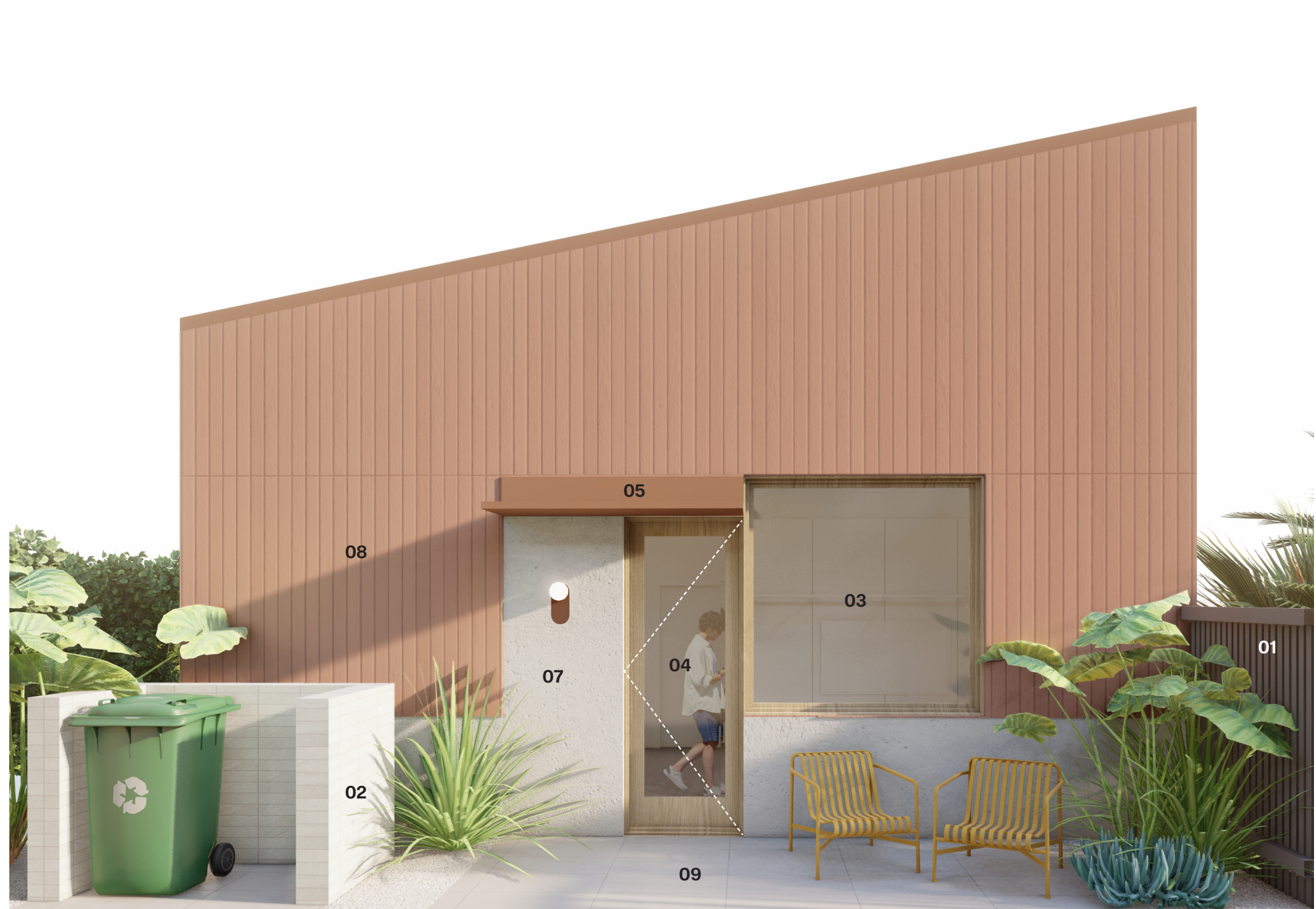
Side Entry Elevation (South) Exterior Development