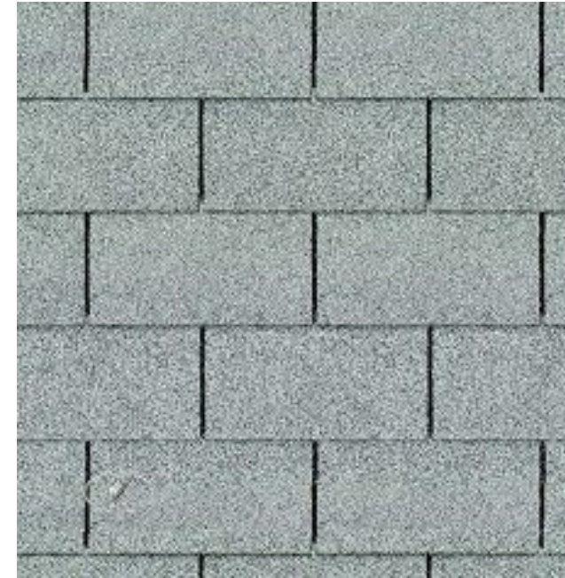
Roof Recycled Asphalt Shingle