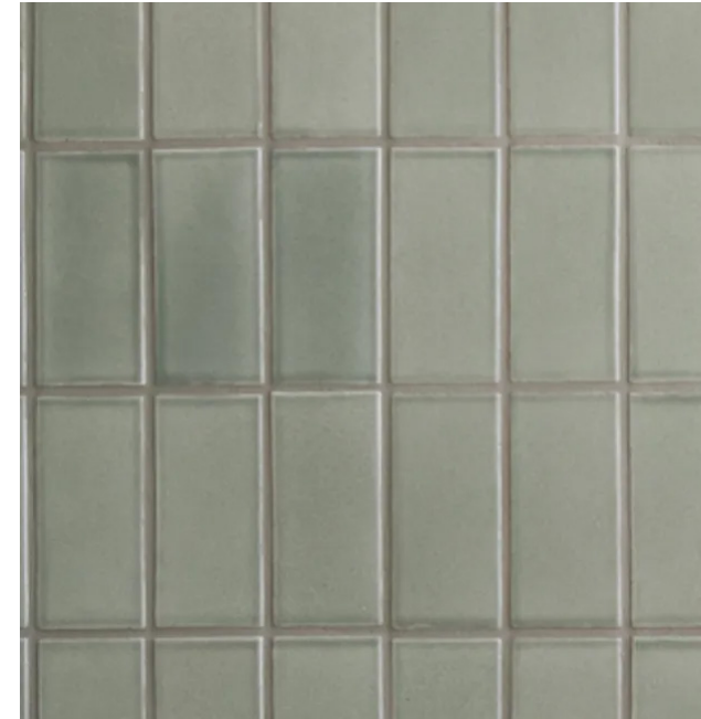
Recycled Ceramic Wall Tile @ Kitchen + Bathroom