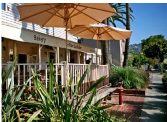
The City’s many cafes with outdoor dining help to create a vibrant pedestrian environment.

The mandatory sections of a General Plan, as described above, are referred to by the State as “elements.” The State permits mandatory elements of a general plan “be adopted in any format deemed appropriate...including the combining of elements” (California Government Code §65301). These mandatory general plan elements are incorporated into various chapters of the General Plan 2035. The terms “element” and “chapter” can be used interchangeably. Sometimes the name of the state-mandated element and the name of the General Plan 2035 chapter overlap. For example, the “Land Use and Urban Form” chapter of General Plan 2035 contains the mandatory “land use” element. Other times, the mandatory element is located within a chapter assigned with a different name. For example, the mandatory “open space” element is housed in the “Parks and Recreation” chapter of