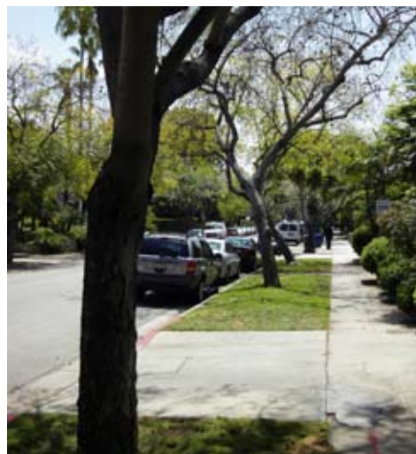
Residential streets form a network of green public space.

In counterpoint to the nearby bustling corridors and centers, the City is also known for its walkable neighborhood streets. Bicycles are also a visible presence on neighborhood and connector streets.