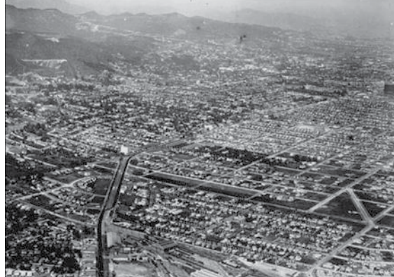
West Hollywood circa 1926, with a dramatic increase in development.