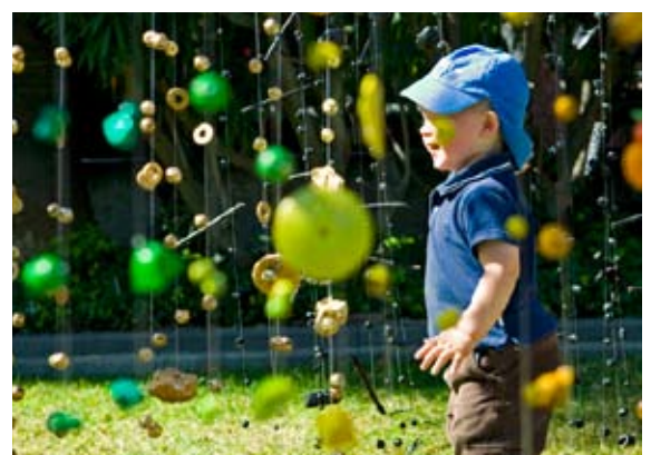
City parks offer access to green space as well as public art installations.