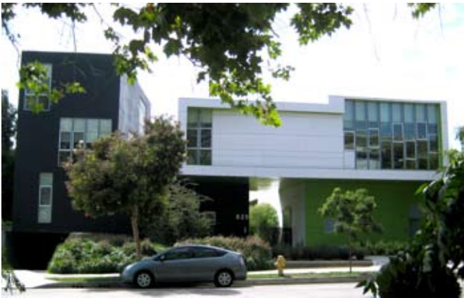
Residential neighborhoods feature an eclectic mix of older and contemporary buildings.

Recognizing that the context in which the General Plan is implemented changes over time, State regulations allow mandatory elements of the General Plan to be modified up to four times per year. Proposed changes must be reviewed by the Planning Commission and the City Council at public hearings, and the potential environmental impacts of the proposed changes must also be evaluated pursuant to the California Environmental Quality Act. The State advises cities and counties to comprehensively update general plans approximately every 20 years.