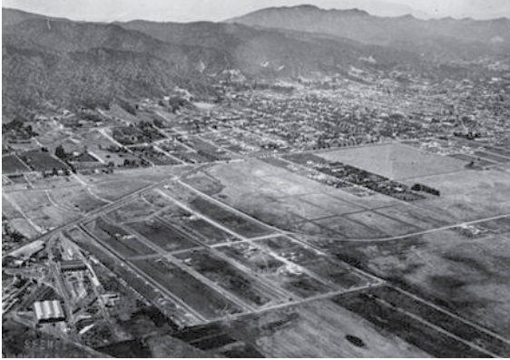
West Hollywood with Hollywood in the background, circa 1922.

The growth in automobile ownership and desire for single-family homes in the Roaring Twenties led to rapid expansion of roads and neighborhood development, determining much of the street and development pattern that survives in West Hollywood today. Neighborhood development flanking Santa Monica Boulevard was particularly dramatic between 1922 and 1926, as illustrated in the photographs below.