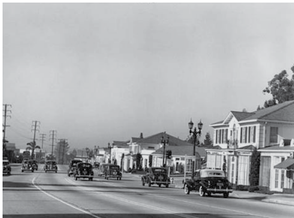
The Sunset Strip, circa 1939.

In the 1960s and 1970s a new wave of clubs opened as the music industry gravitated to the Strip. The Rainbow, Roxy, Gazzarri’s and the Whiskey-A-Go-Go were established in this period and spurred a vibrant music scene that extends to the Troubadour on Santa Monica Boulevard and continues today. More recently, in addition to its lively entertainment scene, the Strip has experienced a wave of new designer hotels and star-chefs, with the arrival of The Standard hotel and major renovations at the Mondrian, Argyle, Andaz, Sunset Marquis, and The London.