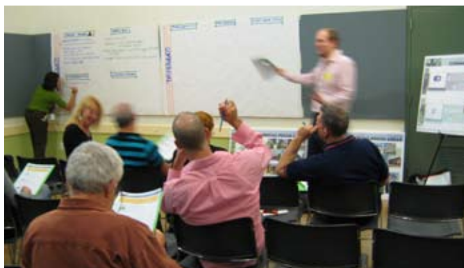
Community input is a critical component of the development of General Plan 2035.

Content from the Environmental Task Force Report, the General Plan Framework, and the Vision 2020 Strategic Plan, was adapted and combined with input gained from the public involvement process to create Guiding Principles for the West Hollywood General Plan 2035.