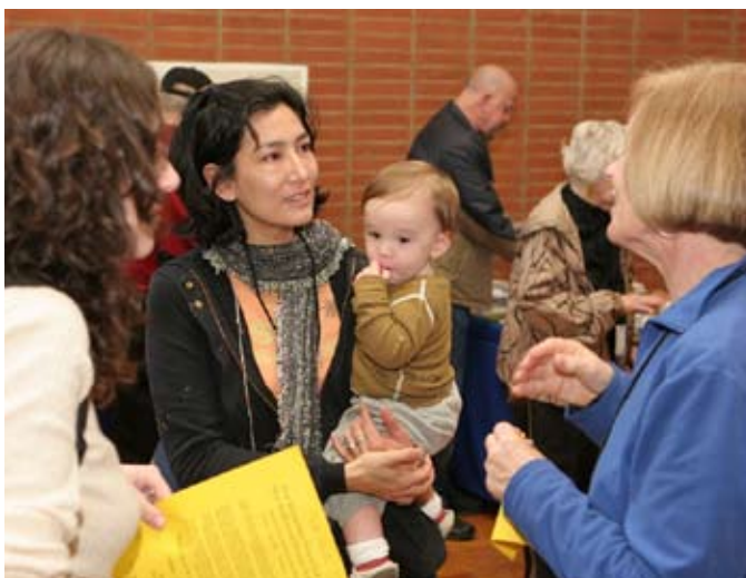
Community members of all ages attended public workshops during the General Plan Update process.