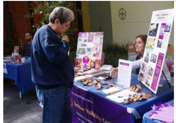
The City’s emphasis on addressing social issues and celebrating diversity remains stronger than ever.