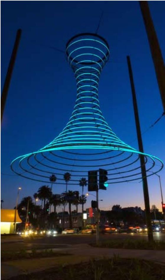
Artist Dan Corson's "Empyrean Passage" illuminates the night sky with contemporary neon art during its temporary display.

West Hollywood is a community known for arts and culture, with strong social networks, a rich sense of community, cross-cultural interaction, and diverse physical spaces for art of all kinds. The section below provides specific policies and a description of the existing context for arts and culture in the City.