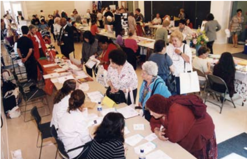
The City sponsors an annual Senior Fair.

State of California law does not require that a city’s general plan address social services, arts and culture, or schools and education. These topics are addressed in this chapter because they promote West Hollywood’s health, safety and welfare, and because they reflect the core mission to support and serve its diverse population. West Hollywood was one of the first cities in California to incorporate a human services element into its General Plan.