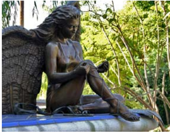
Works of art created under the Urban Art program can be found citywide.