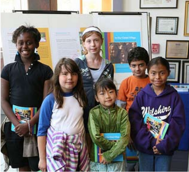
Local elementary school students contributed to In Our Global Village, a book documenting West Hollywood through the eyes of its youth.

assistance, food and nutrition programs, outreach and housing services for people who are homeless, employment services, substance abuse services, assistance to families, and counseling and recreation services for children and youth. The City also sponsors social-services-related transportation programs.