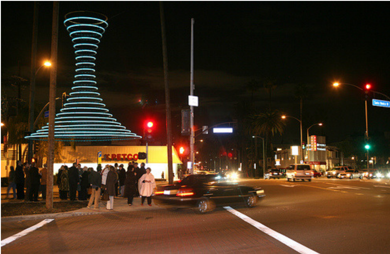
Empyrean Passage – Dan Corson (2008)