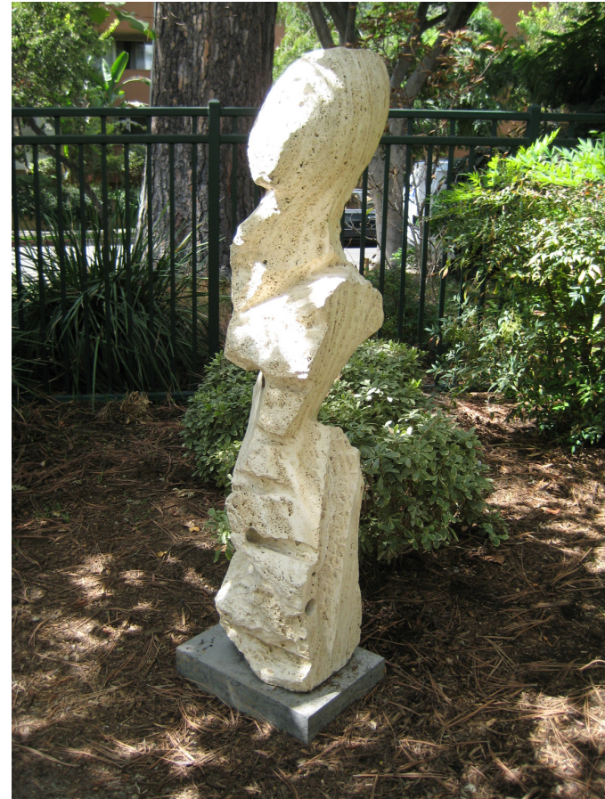
Untitled sculpture by Leonard Cave Kings Road Park (Gift to the City 2009)