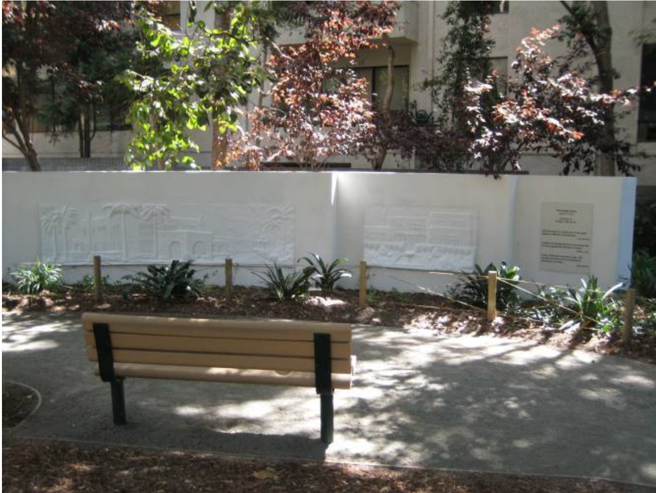
Dodge House Art Wall (2009) - Kings Road Park