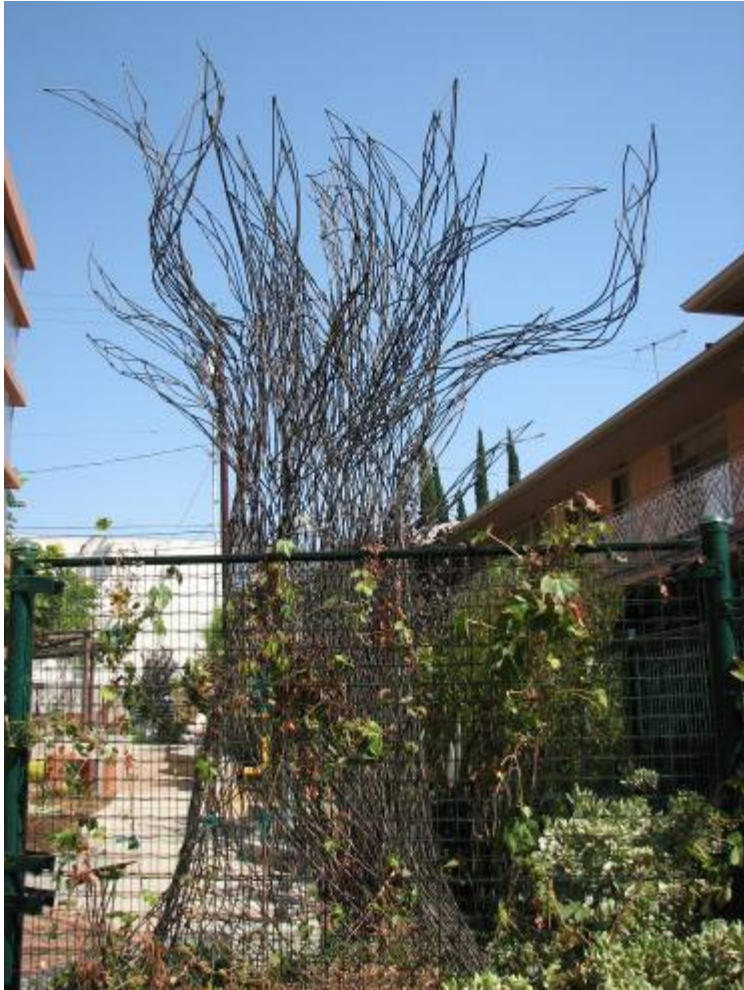
Tree Form – Karl Saliter (2009)