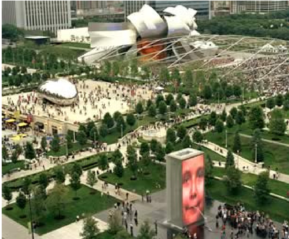
Millennium Park Chicago