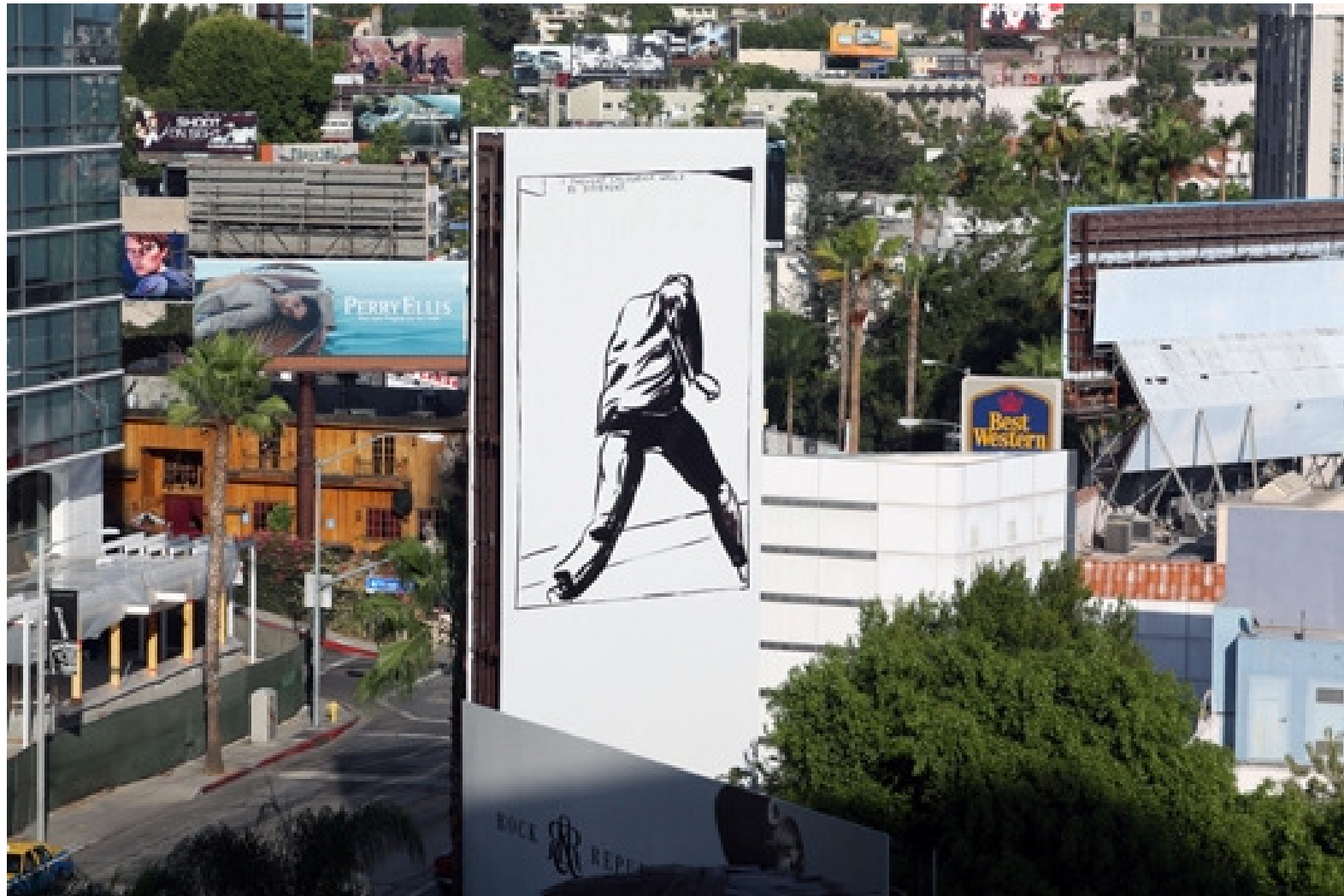
(I thought California would be different) – Raymond Pettibon (2008-2009)