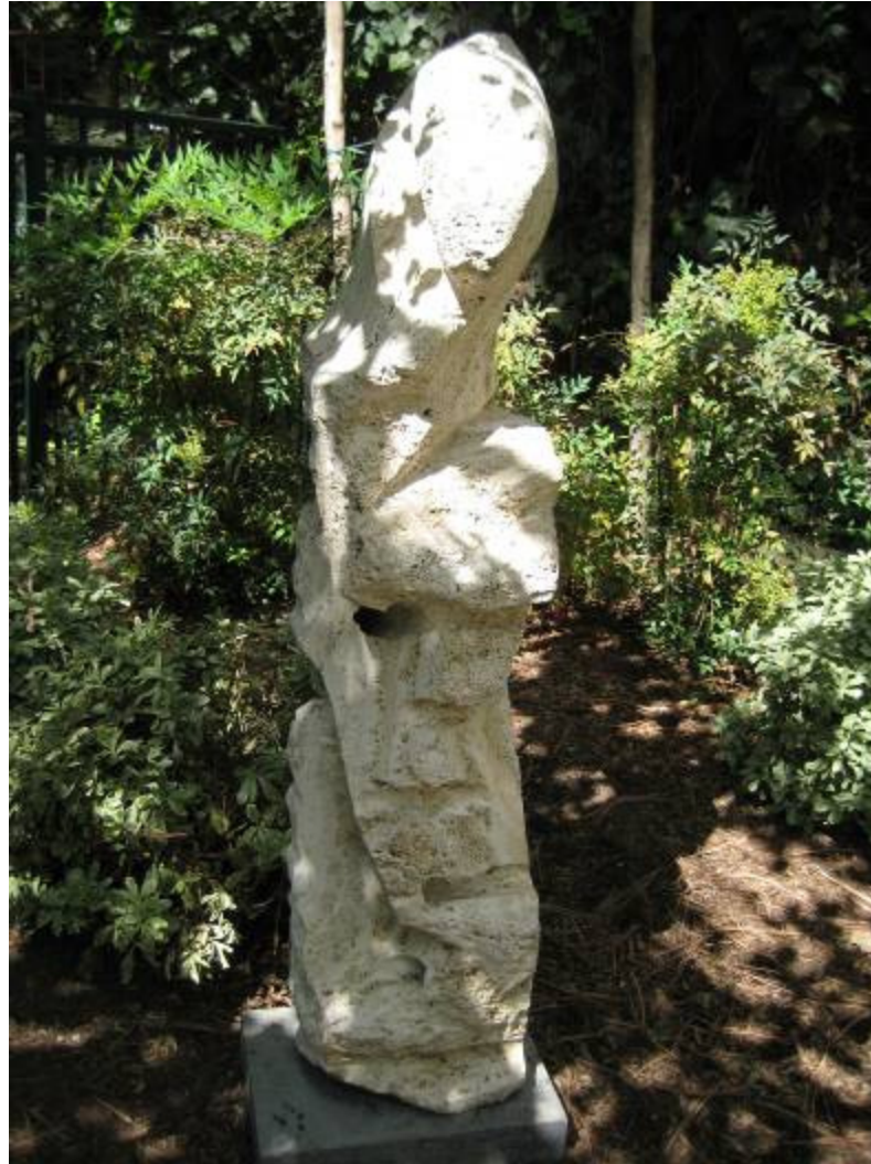
Untitled Work – Leonard Cave (2009) - Kings Road Park