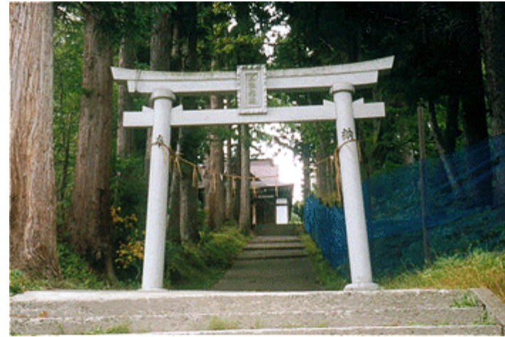
Japanese shrine – Torii Gate

Pattern Language (London Hotel gates) Charles Fine (2009)