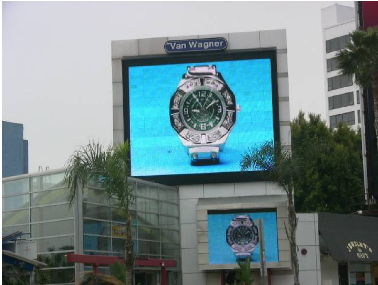
Plenty – Barbara Kruger (2008)