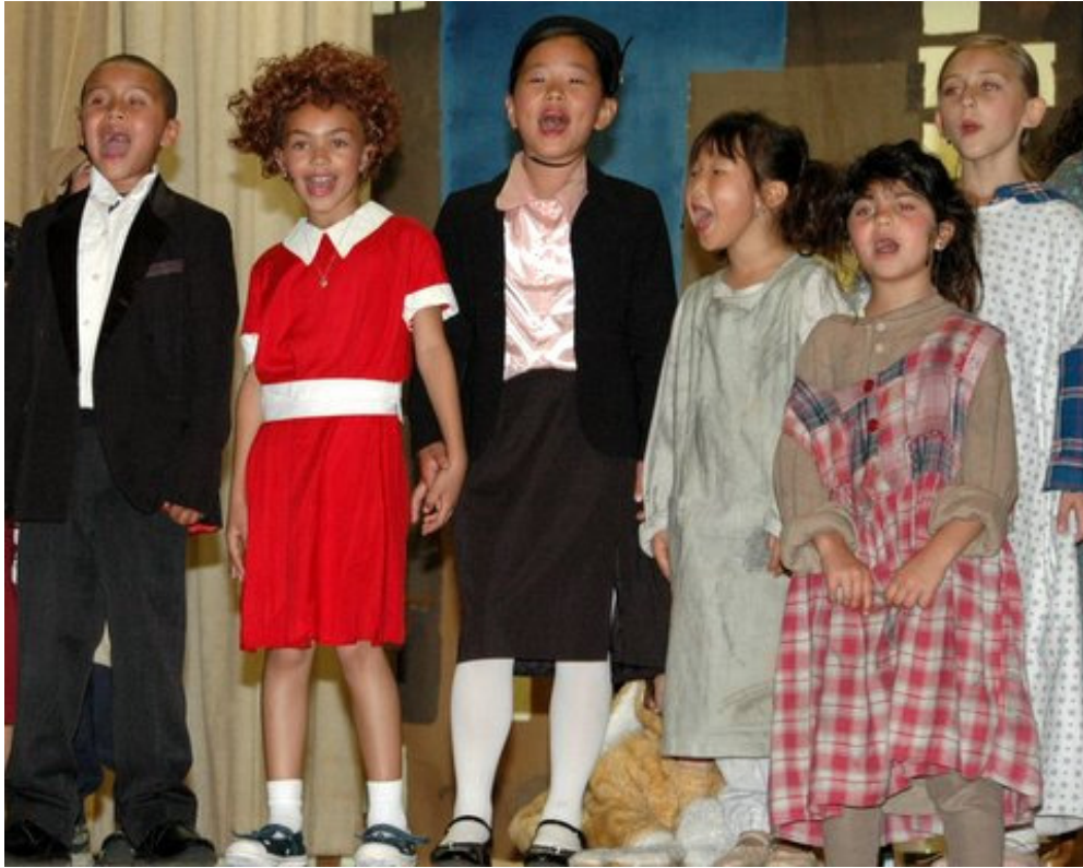
West Hollywood Elementary students perform Annie

Provide expanded programming for the community