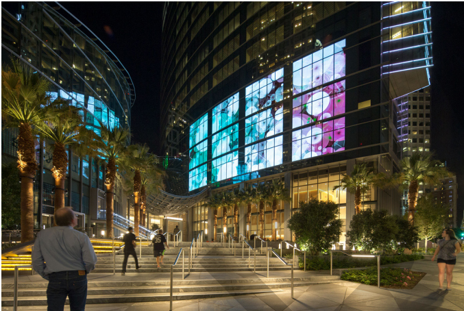
Precedent Images of Creative Integrated Digital Advertising

After scoring is complete, if a tie exists that impacts which applicants are in a top-scoring position, the project that has a higher averaged score in the Design Quality shall be deemed the higher scoring application.