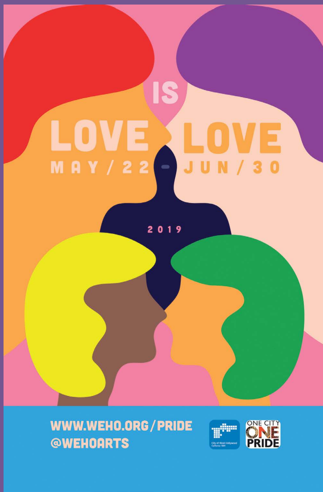
Poster competition finalist: Sasha Studio | Bogotá, Colombia IG/FB: @sashastudiocol | sashastudio.co