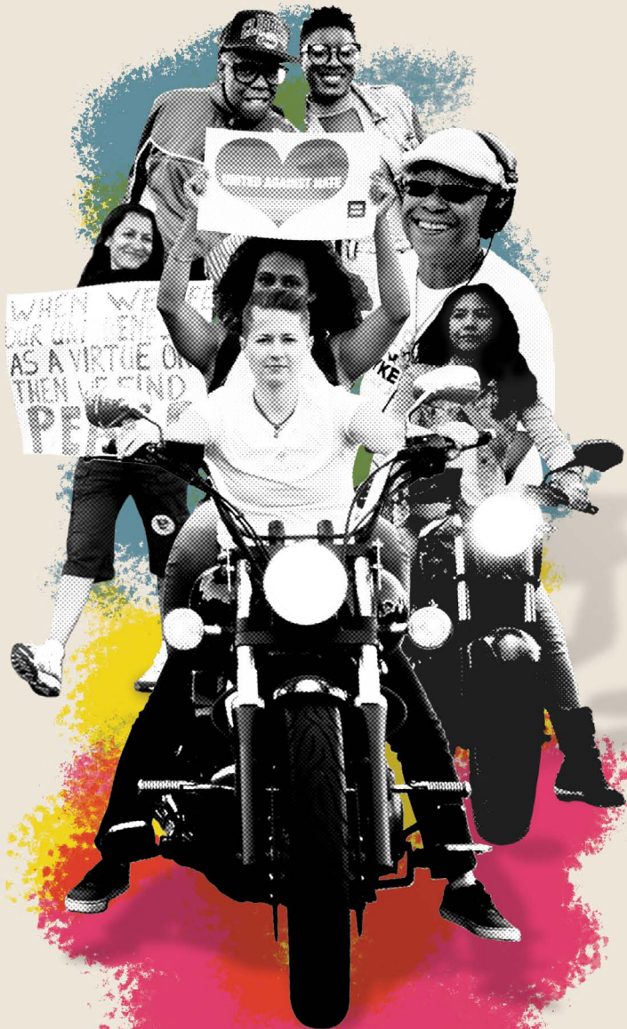
Dyke March