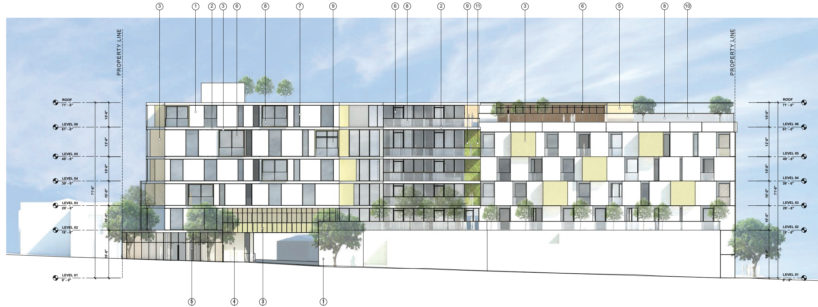
PROPOSED WEST (ORANGE GROVE) ELEVATION 3/64" = 1'-0"

FARING CAPITAL: 7811 Santa Monica Blvd, West Hollywood